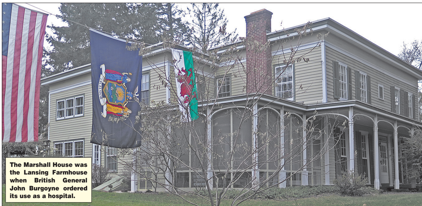
The Marshall House was the Lansing Farmhouse when British General John Burgoyne ordered its use as a hospital.